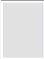
FULL PAGE 7"w x 10"d