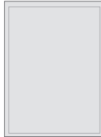
FULL PAGE BLEED 8"w x 10 3/4"d + 1/8" bleed allowance