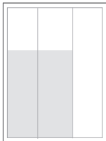
1/2 ISLAND 4 5/8"w x 7 3/8"d