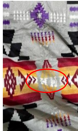
Figure 2. Malhi Pattern